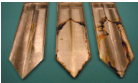
PURITY™ FG Compressor Fluid Synthetic Food Grade Fluid Leading Specialty Food Grade Fluid