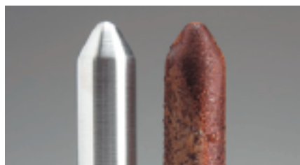
PURITY FG Specialty Chemical Company

Unlike the leading chemical company's fluid, PURITY FG Trolley Fluid passes the demanding ASTM rust test (Sequence A & B). This strong level of corrosion protection can extend equipment life in the wettest operating conditions while protecting food products from rust contact.